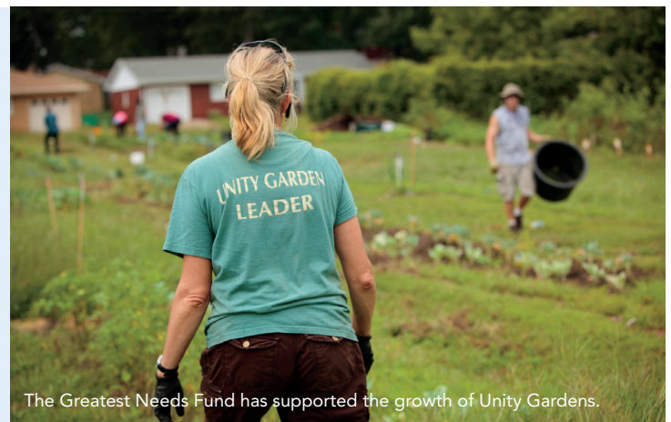
The Greatest Needs Fund has supported the growth of Unity Gardens.

Through the fund, we're helping RiverBend Cancer Services create a beautiful Wellness House for people affected by cancer. We're helping Junior